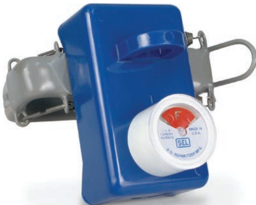
Underground AutoRANGER with Integral Display.