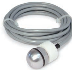
Tamperproof Bolt Display option.