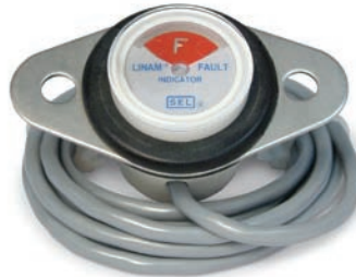
Standard "V" Display option (BEACON LED optional).