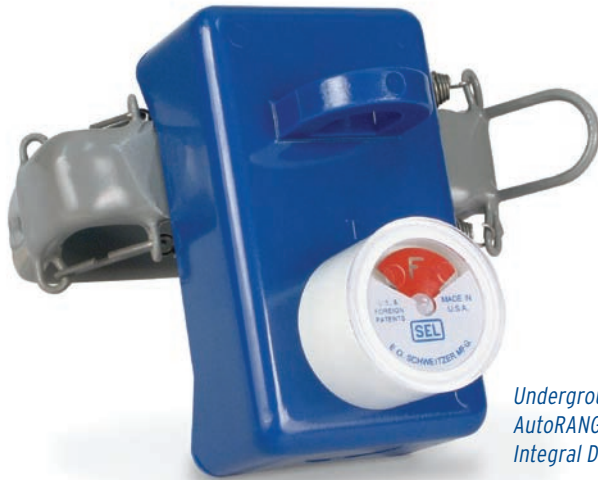
Underground AutoRANGER with Integral Display.