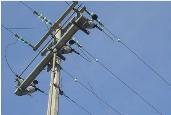
Overhead AutoRANGER application.