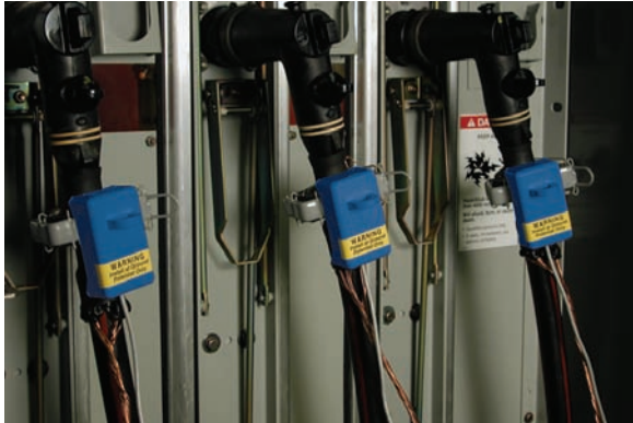
Underground AutoRANGER application.