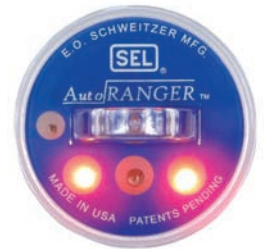
Permanent fault indication.