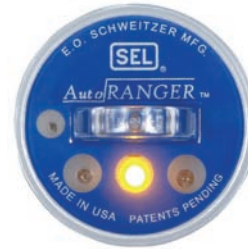
Temporary fault indication.