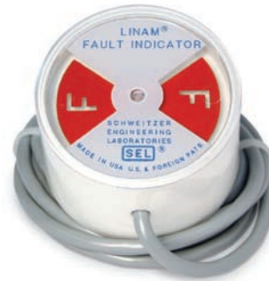
Large "L" Display option (BEACON LED optional).