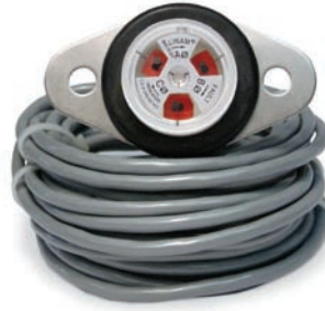
Three-Phase "3" Display option.

Each AR-URD derives a normalization current as a function of measured circuit load. The AR-URD uses the normalization current to distinguish circuit restoration from backfeed current; it is this threshold that the AR-URD must detect before initiating the reset timer (0, 2, 4, or 8 hours). Targeted AR-URDs provide fault indication until the time criteria have been met following the detection of normalization current. The AR-URD interprets currents lower than the normalization current as backfeed, and consequently delays automatic reset.