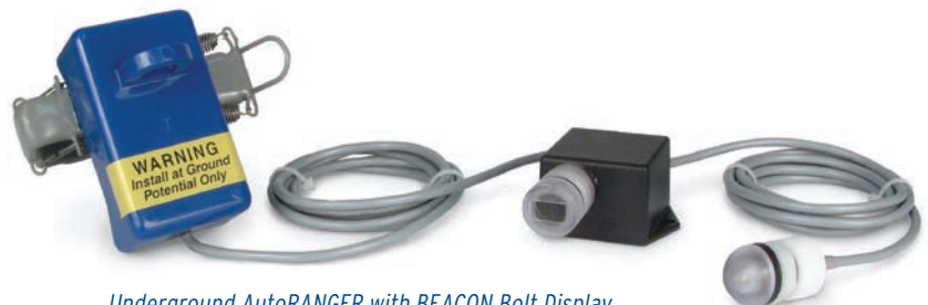
Underground AutoRANGER with BEACON Bolt Display.